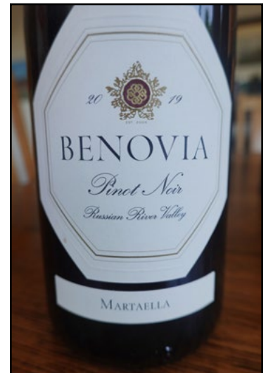
The Benovia Pinot Noir was among the best Pinots at the wine tasting.

Cab Franc sometimes suffers from vegetal bell pepper aromas