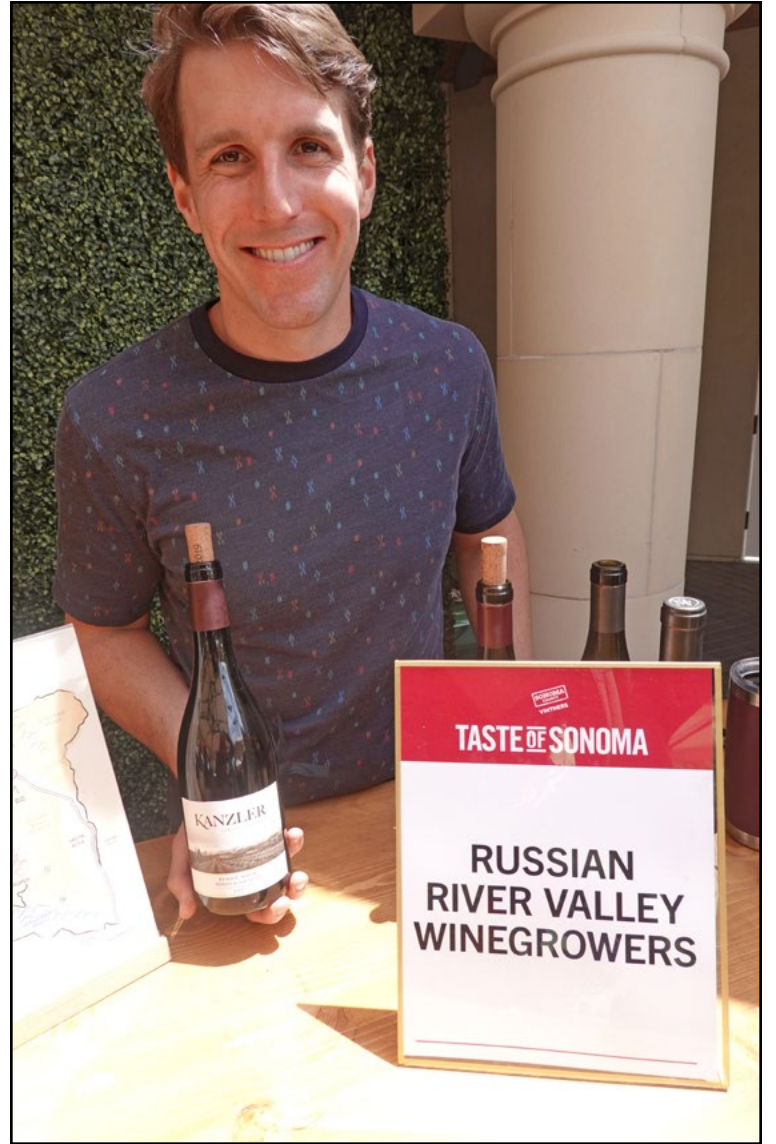
Guests were greeted at the Taste of Sonoma wine tasting in Santa Rosa.

Concentrated and imbued with a coil of juicy acidity and energy. Opulent and composed at once, it offers notes of peach, nectarine, yellow plums, apples and pineapple. Through the finish, there is